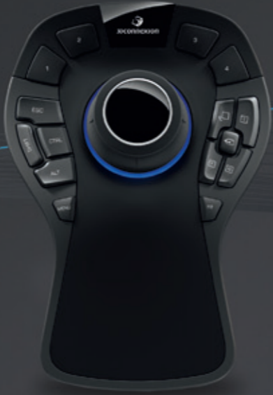
SpaceMouse™ Pro Superior 3D Navigation for Professionals