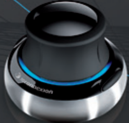
SpaceNavigator™ Advanced 3D Navigation for Everyone

SpacePilot Pro is the ultimate professional 3D mouse, engineered to excel in today's most demanding 3D software environments.