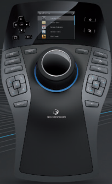
SpacePilot™ Pro Ultimate 3D Navigation for Power Users