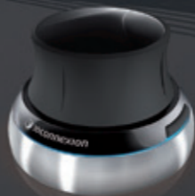
SpaceNavigator™ for Notebooks Enjoy 3D Navigation on the Go